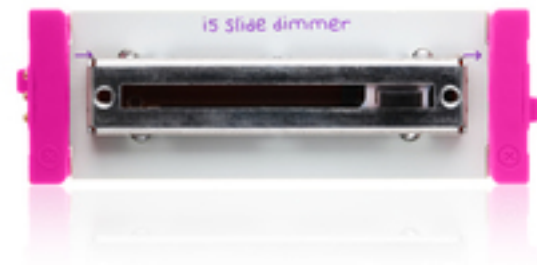
slide dimmer (1)