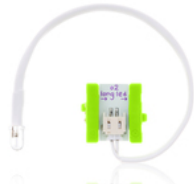
long led (1)