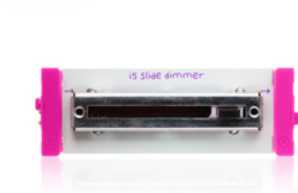
slide dimmer (1)